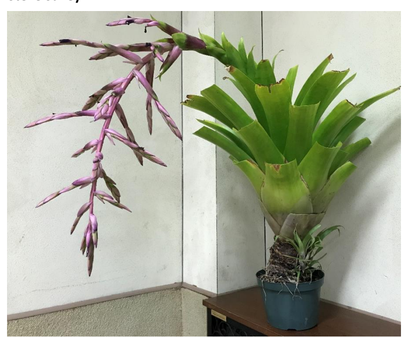
Tillandsia australis (Wow!)